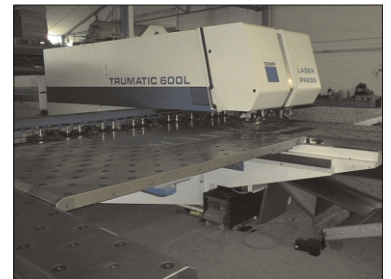
Jobs can be transferred quickly regardless of the technology being used

The speed of getting information into JETCAM in comparison to the old system was immediately noticeable. "JETCAM is so simple. Even without having any knowledge of CAM you can learn to program the machine in a short time", said Alf Rodeike. "Cleaning of DXF files also saves time, with even the 'dirtiest' file taking only a few minutes to make it useable."